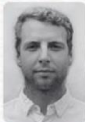
Tom Courty Ball Investment Club