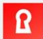
ROOM ROOM SG